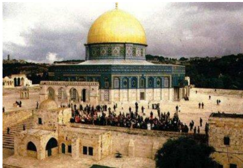
Masjid al-Qubbatus-Sakhra (Also known as The Dome of the Rock)

At its centre is the celebrated Dome of the Rock. The entire area is regarded as Bayt-Al-Maqdis or Al-Qudus and comprises nearly one sixth of the walled city of Jerusalem.