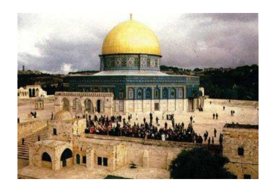
Masjid al-Qubbatus-Sakhra (Also known as The Dome of the Rock)

At its centre is the celebrated Dome of the Rock. The entire area is regarded as Bayt-Al-Maqdis or Al-Qudus and comprises nearly one sixth of the walled city of Jerusalem.